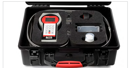
The hand-held clamp-on flowmeter KATflow 200 was the perfect combination of portability and reliability.